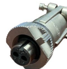
ACS06E-10SL-4S (023) Mate Connector