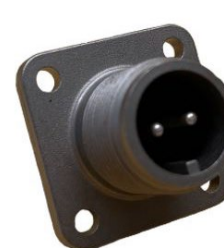
ACS02E-10SL-4P (023) Military Connector (MC) with electroless nickel plating