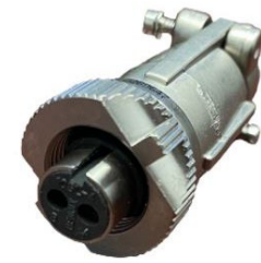
ACS06E-10SL-4S (023) Mate Connector