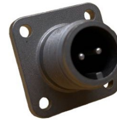
ACS02E-10SL-4P (023) Military Connector (MC) with electroless nickel plating

STANDARD MILITARY DC CONNECTOR (MC OPTION)